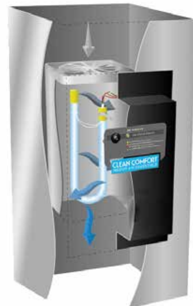
Model UA2000DV shown

Try our family of Clean Comfort brand products for your whole home